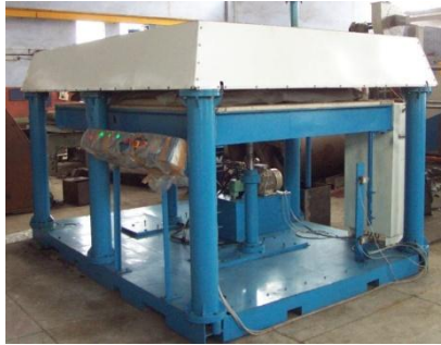
Snehabha carpet Backing - A proprietary one supplement to Make in India Mission

Tibetan, India Knot (A proprietary knot known as “India Knot” has been licensed to industry) etc. Quite a few consultancy assignments have also been completed.