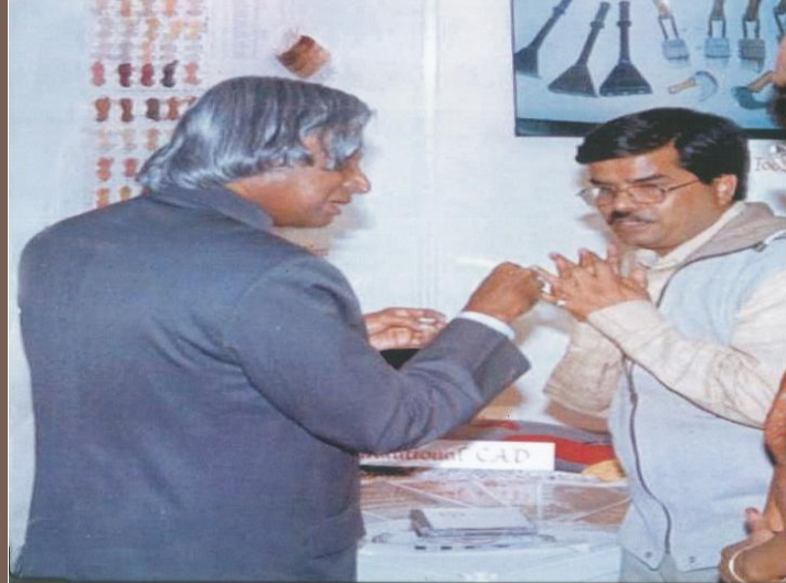
His Excellency Dr. A.P.J. Abdul Kalam President of India inspected the IICT pavilion at Vigyan Bhawan, New Delhi on the occasion of Golden Jubilee Celebrations of Handicrafts on 15.11.2002. Appreciated the work done for a such rural and cottage sector providing valuable inputs- which is one of the greatest award I could get in the life.

Time to time review by extra ordinary Visitors, press & media also took place and Coverage, Snaps of Golden moments and Comments of Salient Visitors are