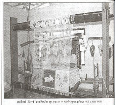
आईआईटी (दिल्ली) द्वारा विकसित लूम तथा उस पर कालीन बुनकरों का प्रशिक्षण। पीछे - अन्य कालीन