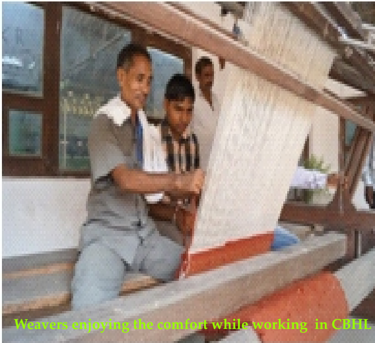
Weavers enjoying the comfort while working in CBHL

▪ India Knot: A proprietary one of IICT which permits semi knotting its loom supplement to Make in India Mission - Industry to come forward & Explore