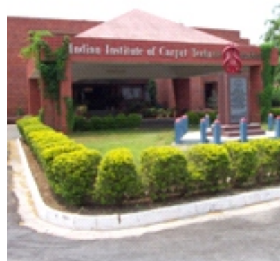
Administrative Building of IICT

given the autonomous status in December 1998 through formation of society. Involvement of broad based stakeholders/authorities include Govt. of UP, Industry, Academicians, Industrial experts, statutory bodies/authorities like AICTE, University, NABL, IFW-MOT, experts from all region of the country in the Executive Committee Chaired by DC (Handicrafts) resulted role clarity and achievements.